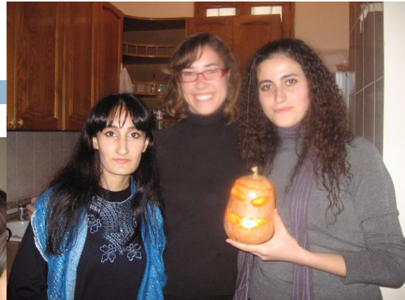
Halloween Party, October 2010